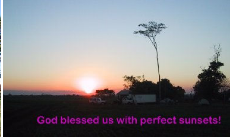
God blessed us with perfect sunsets!