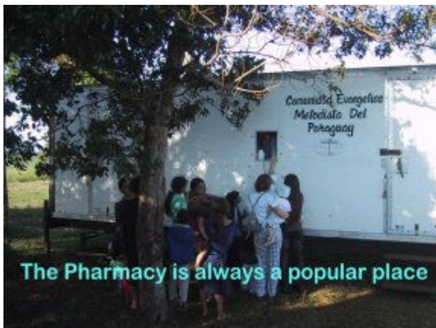
The Pharmacy is always a popular place