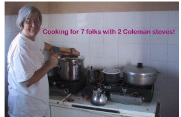
Cooking for 7 folks with 2 Coleman stoves!