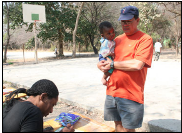
7 month old Mafenyeho also needed help at the finish line

This month our older children – those in grade 8 and above – were living in hostels at their schools. The national school system provides a type of boarding school environment for the older children. There are 19 children from Zion attending these schools and are considered "out schoolers". We still have 27 children currently in residence, which makes for lots of drama!