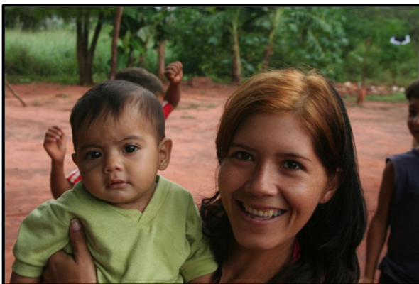
Friends from Quinta Linea, Paraguay