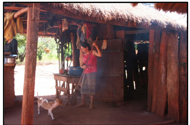
She lives next to the church in Oga Lata, Paraguay

We end by once again asking for your prayers as we continue to use the gift of abundant, clean water to share the Gospel of Jesus Christ.