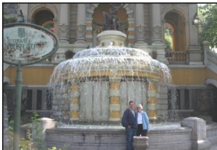
Here we are touring the beautiful city of Santiago.

As soon as we got back from Chile, we headed back to Yrybucua. We have 2 more wells we want to finish before heading to the states for Christmas. We started a well at the Yrybucua central Methodist church the last day of October. To know the details of this well you will have to wait for November!