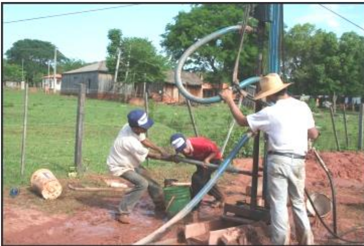
This well is 286' deep, so breaking rod can be difficult.

We finished our 22 nd project this month for the "city" of Yrybucua. This project was a little different. This was for a community and not for a church or church facility. The community paid for the PVC well casing, diesel fuel and our laborers. We provided the drill rig and our labor as a good will offering to the community on the behalf of the local Methodist Church.