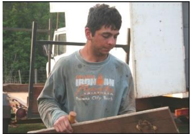
This young man has been with us for 4 projects and has become a great driller.