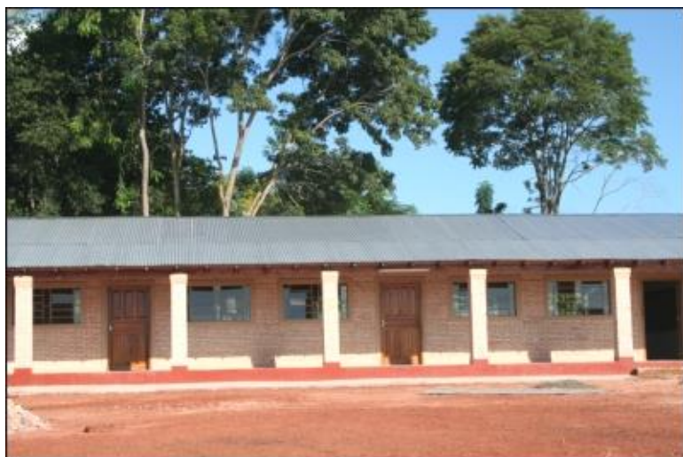
This is from the front with the new paint. On the right is the corridor with the nice new tile.

The Susannah Wesley School is just about finished! PTL! We still think that the closer the school comes to being “finished” the slower our work crew works. We’ve added a new section to our web site www.aguadevida.org , “Susannah Wesley School in Quinta Linea”, with lots more photos. Here are just a couple of recent shots.