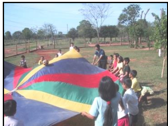
Someone donated a parachute for the children to enjoy