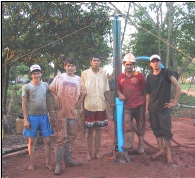
Our highly trained, professional, experienced team of drillers is ready to drill your next well – just give us a call!

Also below is a photo of our drill crew. This was a hard working bunch of guys, even if they didn't wear shoes.