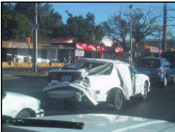
And you thought this car shouldn't be driven!

Since we have already made this a longer than normal monthly update, we'll include a few "road scenes". For those of you who haven't had a chance to get the family car to the body shop after that little fender bender – take heart! Add some Saran Wrap and just drive it anyway! And for those that don't like to wait for traffic lights, how about waiting for a "cow crossing"? A little more interesting!