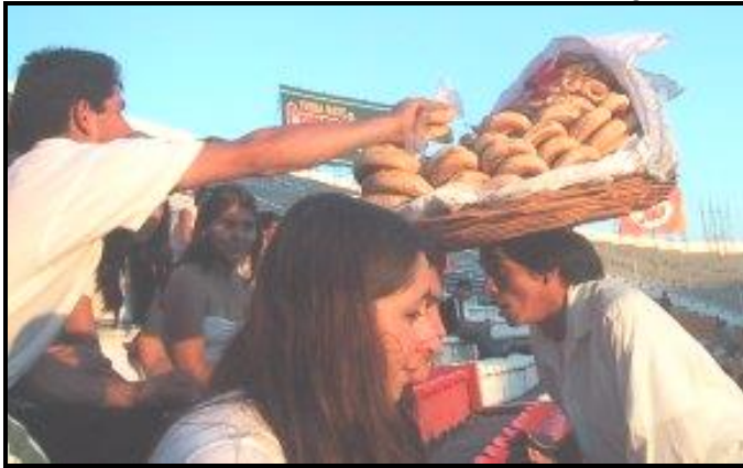
Hungry? Buy a chipa!