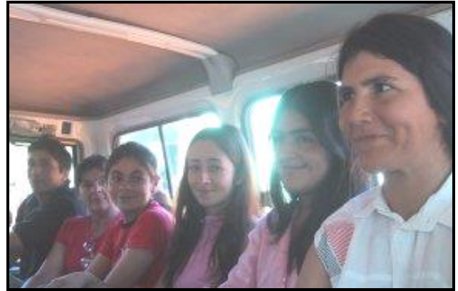
Yes, we had 11 people in the back of the Land Cruiser, plus us 2 in front! The girl second from the right was a non-believer, but went “down front” during the invitation to receive Jesus in her heart!