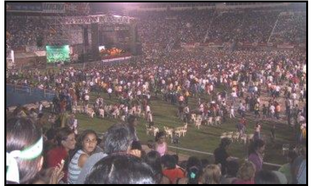
Crowd coming down, after the invitation, for prayers

In Spanish the Crusade is named Festival de Esperanza, which means Festival of Hope. We all have hope for a Spiritual Awakening here in Paraguay.