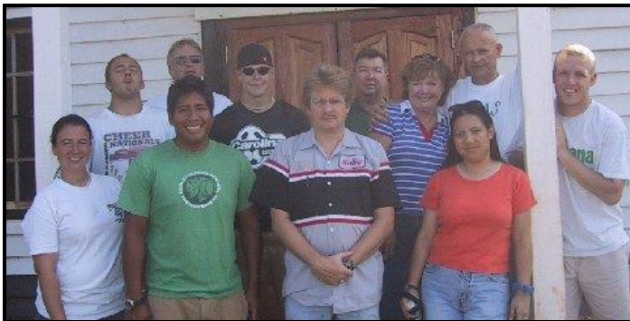
The Memorial UMC, Fernandina Beach, FL

This has been a great winter for us and we thank each team member for contributing to the ministry for the people of Paraguay. In addition to all the construction help, all 9 of our "North District" churches were able to have a Día Feliz (VBS), and all 9 churches had a North American work team visit during a worship service.