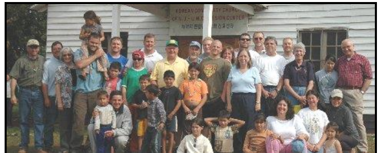
Cannon/Duluth Team with many new friends Cannon UMC, Snellville, GA Duluth UMC, Duluth, GA