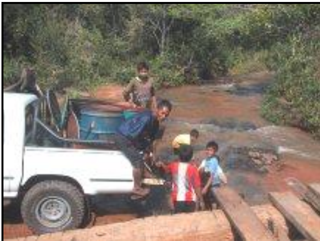
Getting water can be fun for adults too!

The second week we drilled the well at the Reservation. The well drilled to 42 meters (138.6'). We have so many good pictures from this project; we just don't know where to begin. Here are some (we added a new section to the web site with more pictures of the Reservation):