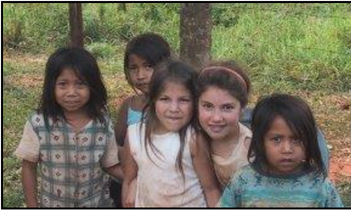
Kids watching us work