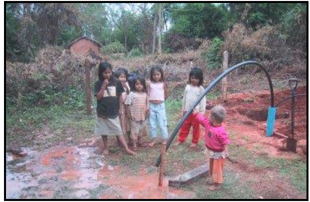
The kids also liked cleaning out the well