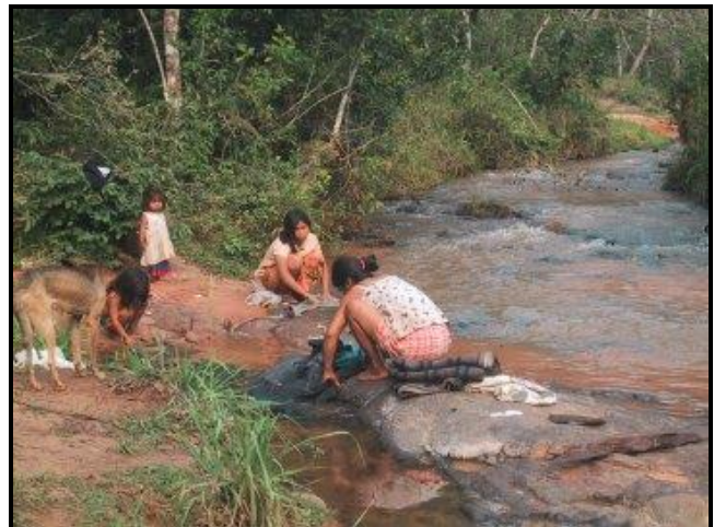
While at the creek, these ladies were doing their laundry