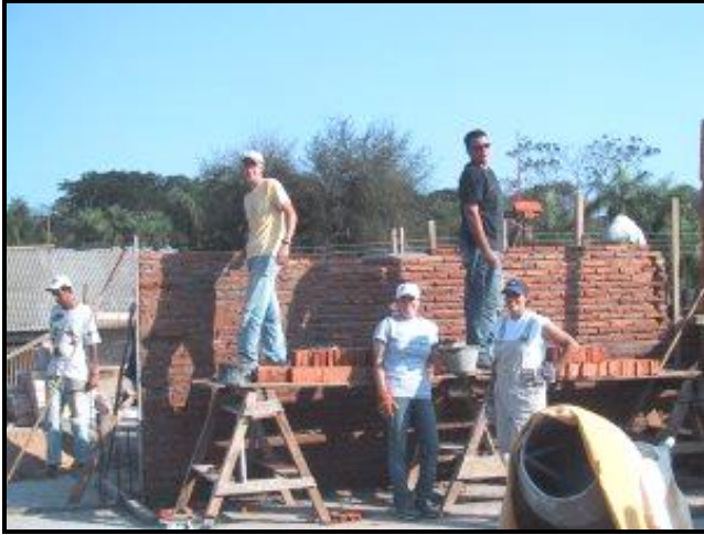
Construction team at Ñemby

We ended our June report telling you about Snellville, GA UMC coming to Paraguay with a work team. What a great team this was! They were here for 13 days, and we filled each day to capacity. The team divided into 2 groups, 1 group assisting with the construction at our Seminary in Ñemby. The other group took VBS to 4 different churches in the Asunción area.