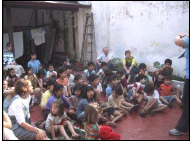
VBS team at San Vicente

During their “free” week-end, we brought the team to our Northern District. The team had the opportunity to visit 5 of our local churches. We think the opportunity of getting into the Interior gives a group a better understanding of the poverty in Paraguay. We did manage some tourist activities. Their final full day we visited Iguazu Falls in Brazil. We think the team went back to Snellville with lasting memories of Paraguay.