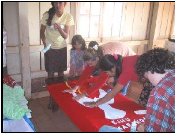
Banner project for Quinta Linea