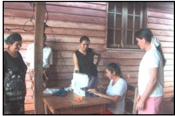
Sewing class at Yrybucua

As part of the sewing class, on the 1 st day each lady was able to make a small draw-string bag. The 2 nd day, we introduced making skirts. The ladies were very proud of their handy work. This is a picture of a member from Quinta Linea. She proudly wore her new skirt to church that night.