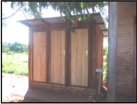
Bathroom at the school, 2 toilets with sinks and a shower in the middle