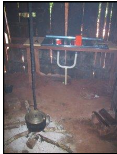
Andresa's new kitchen sink – strange to see the stainless steel sink in front of the burning wood which is her “stove”

The project at the Indian Reservation at Y'Apý was also completed. This project has been more extensive than other projects as we installed a 3 room bathroom for the school located on the Reservation, in addition to our normal plumbing of the pastor's home and a bathroom for the church. We also added a few more spigots around the area for use on the soccer field and within the village area and a triple-sink clothes washing station.