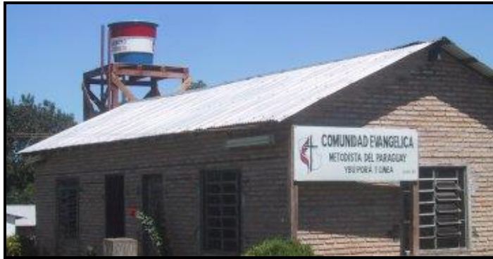
Tank behind Sunday school building

We were very blessed in December to be able to finish all our current projects before heading to the states for our mini-furlough. If you will remember, we began the well at the Primera Linea Church in October, with a group of 4 guys from Firebaugh UMC in California. Below are some pictures for you to see how Primera Linea was completed.