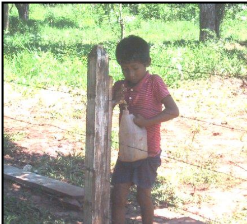
This boy was getting water from the spigot as soon as the spigot was installed