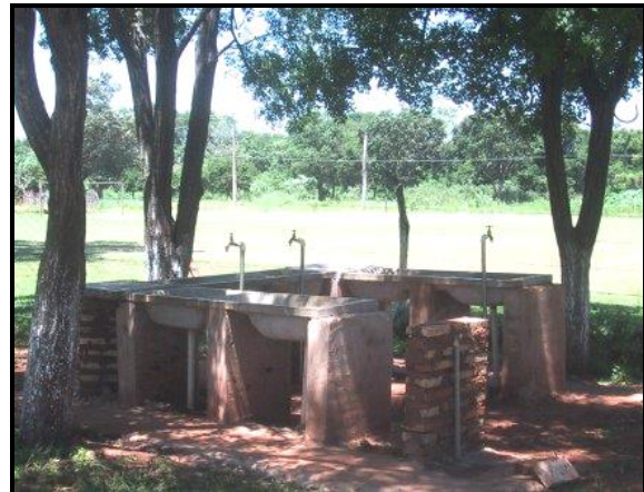
New 3 sink wash station, no more taking laundry to the creek!