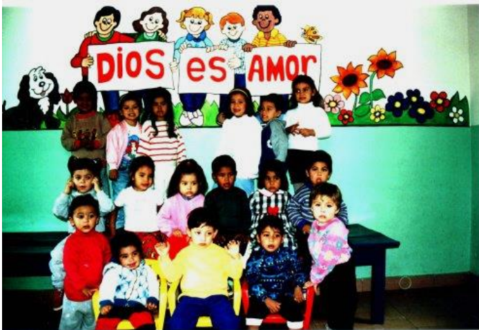
Children from the kindergarten in Santa Rosa