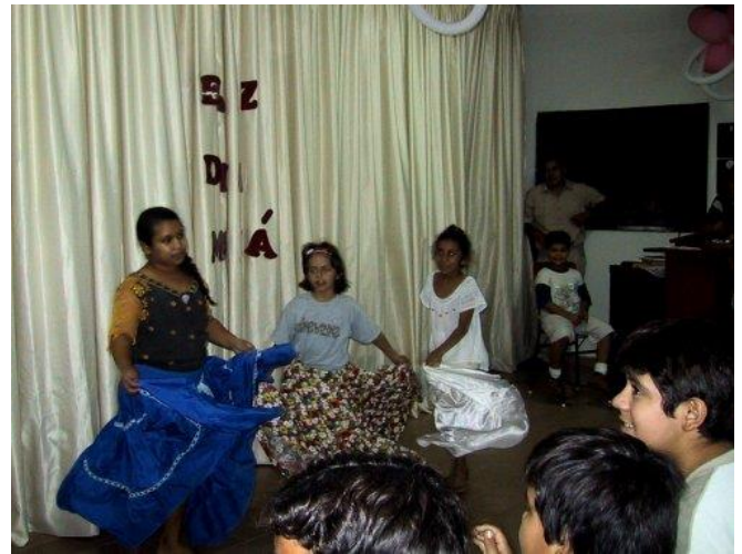
Dancers from Mother's Day celebration