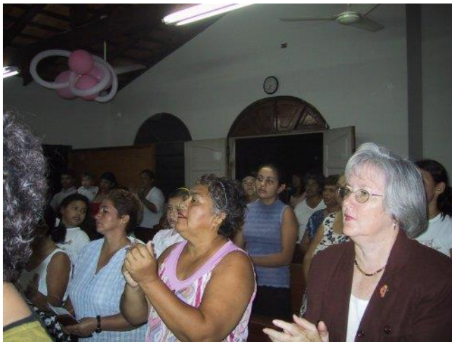
Full congregation at Santa Rosa for Mother's Day