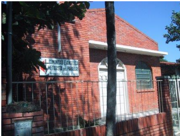
Church at Santa Rosa