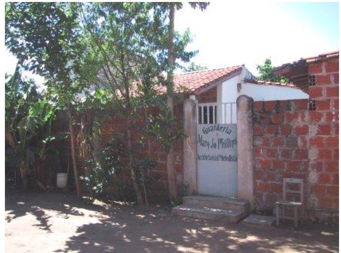
Entrance into the kindergarten