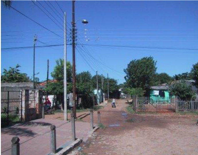
Entrance into the Santa Rosa neighborhood