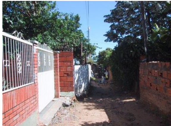
On the left is the gate into the church