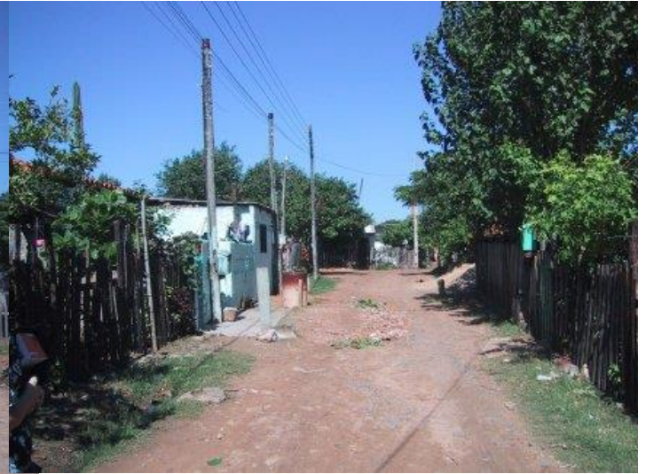
Main Street in the neighborhood