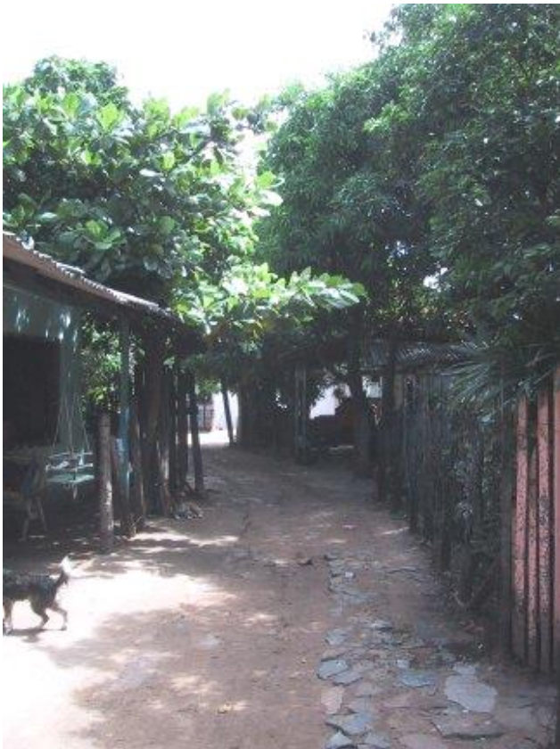
The neighborhood path to the church – most of the access into the barrio are like this (or smaller)