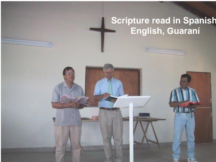
Scripture read in Spanish English, Guaraní