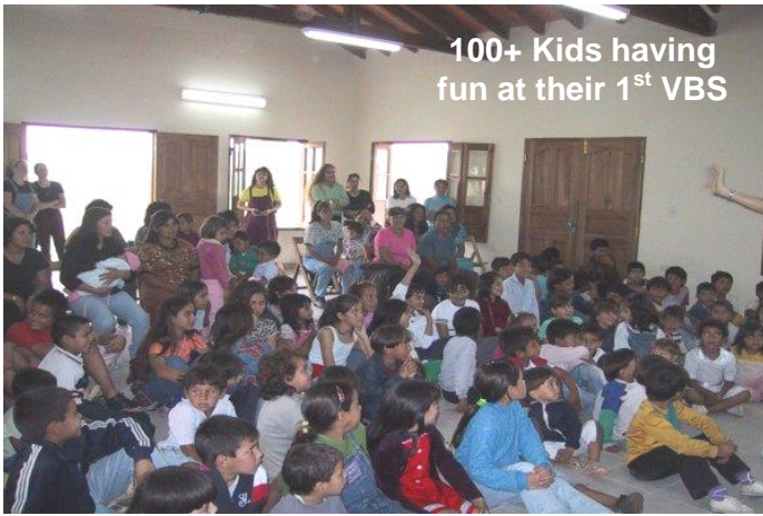
100+ Kids having fun at their 1 st VBS